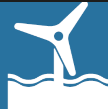
Floating Offshore Wind