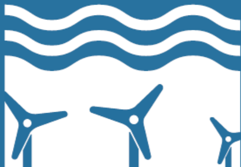
Tidal Stream Energy