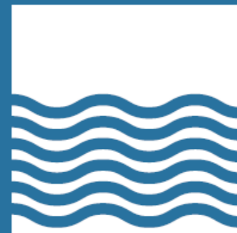
Tidal Range Energy